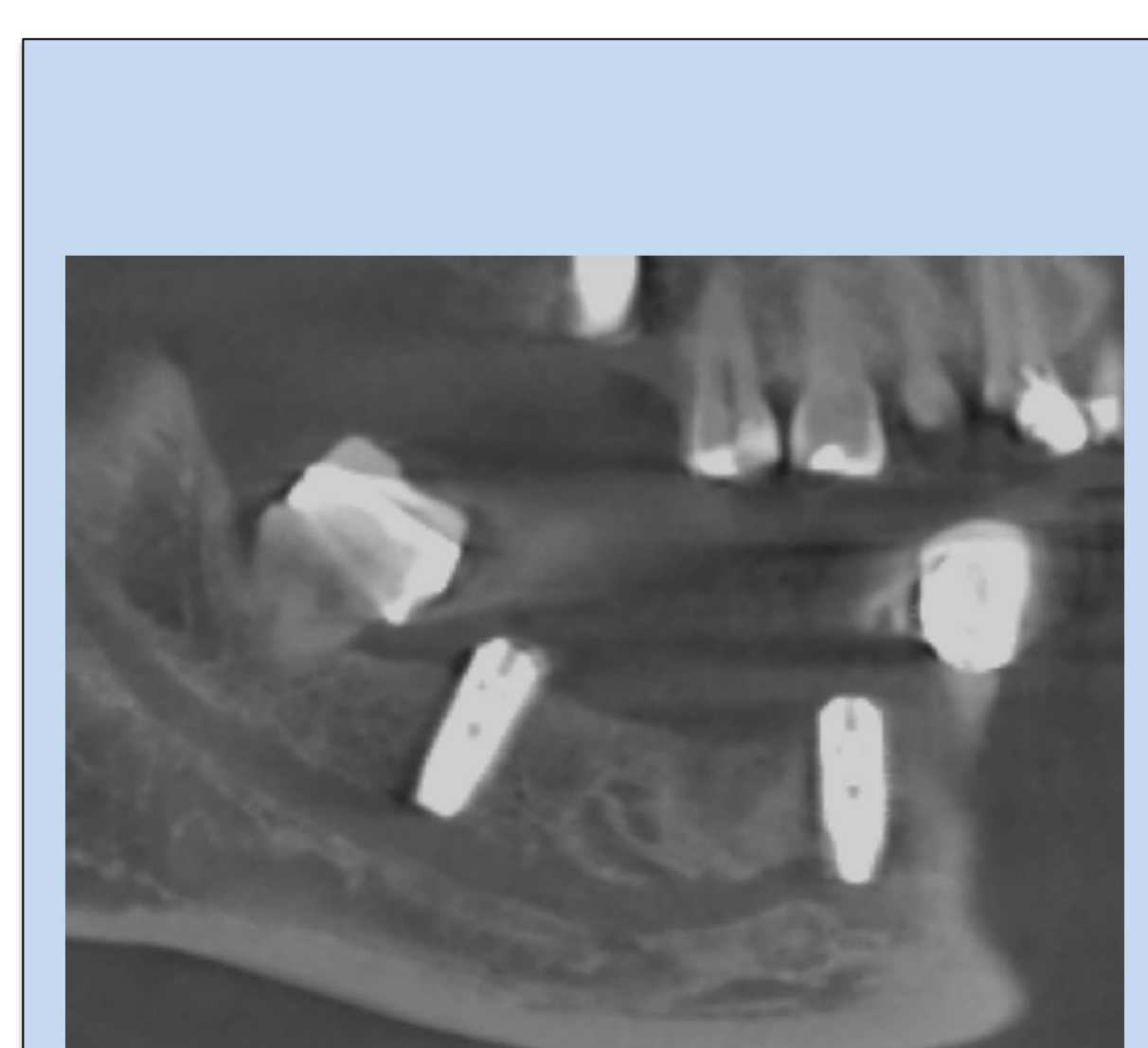
Figure 4: Cone beam CT indicating placement of the mesial implant in the inferior alveolar nerve and the distal one at the roof of the canal.

Using a prospective human study design, data are presented as mean and statistical comparisons were performed using the Mann-Whitney Test or Spearman Correlation. The analysis was done with JMP® 10.0 statistical software (SAS Institute, Cary, NC, USA)