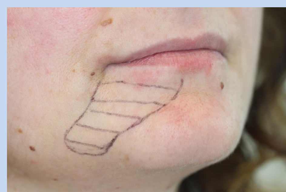
Figure 3: Mapping of the affected area.

The radiological examination showed protrusion of the implant in the alveolar nerve canal in one case treated alio loco. In the other cases proximity to the inferior alveolar canal was evident and x-rays measured using ImageJ®.