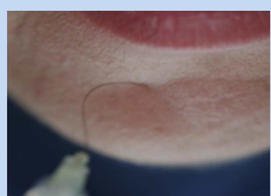
Figure 1: Mechanical Detection Threshold (MDT) was measured with a standardized set of modified von Frey filaments (Optihair2-Set®).

QST is a non-invasive, psychophysiological approach to evaluate thermal and mechanical somatosensation. The present study applied the protocol implemented by the German Research Network on Neuropathic Pain (DFNS) 1,2 in the orofacial region. Patients who had obtained an implantation in the lower jaw combined with augmentation procedures were examined by implementing a comprehensive QST protocol for intraoral use. Patients were tested bilaterally in the innervation areas of the mental nerve (chin and lip/extraoral and intraoral) and results compared to healthy controls as well as patients being implanted several years ago and patients with a neurological deficit. Thermal and mechanical tests were performed in patients with a radiographically and clinically injured nerve as well as in patients after implantation with no clinical symptoms.